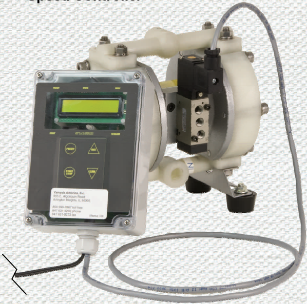
YSC-3EX Speed Controller